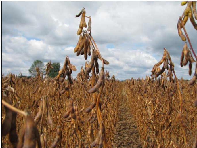
Figure 1 - Late Developing Cluster of Pods at Top of Plant

bu/ac. This is in line with previous results, which averaged a 1.8 bu/ac response over a three year period. Although tillage does add a small amount to yield, the response is generally 1 – 2 bu/ac. This year does not seem to be an exception.