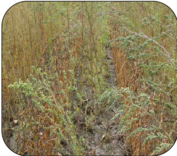
Figure 1. Dual + Sencor (Woodstock, ON – 2008)