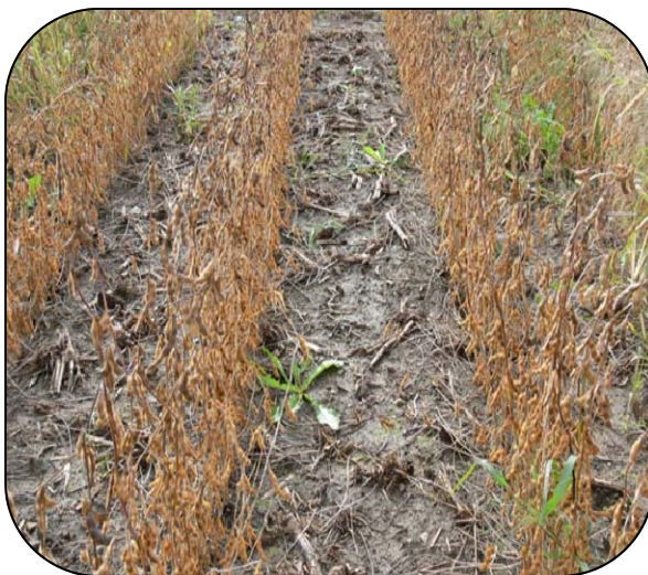
Figure 3. Pursuit + Valtera* (Woodstock, ON – 2008) *Experimental treatment – not currently registered