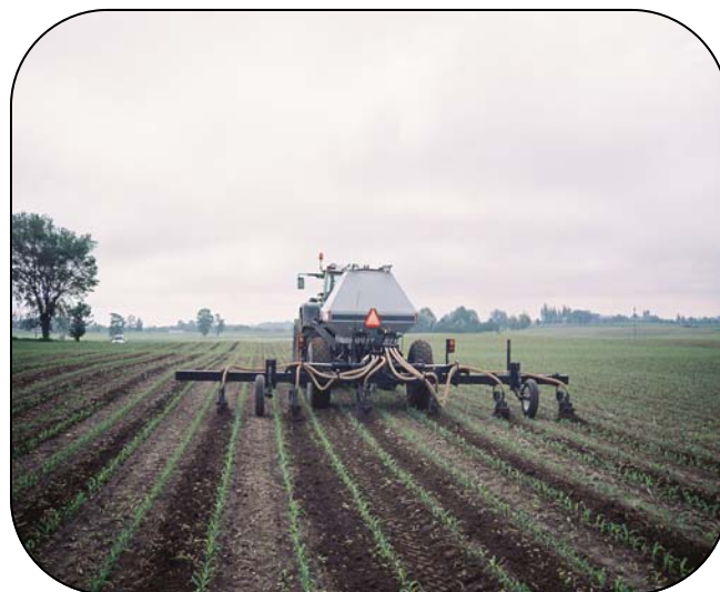
Figure 2. Claussen Farms of Brucefield Ontario sidedress urea with an air cart in their efforts to capitalize on sidedress efficiencies and the cost advantages of urea over UAN. Note the applicator bar using coulters to incorporate urea in a skip row configuration.

The research is quite variable in measuring losses from surface applied urea. It is substantially higher than surface applications of UAN and can reach 40% N loss. This means significant additional costs and the practice has few upsides. A more appropriate system would be to capture the efficiency advantages of sidedressing and the potential lower costs of urea by investing in a system to sidedress the granular product (refer to Figure 2).