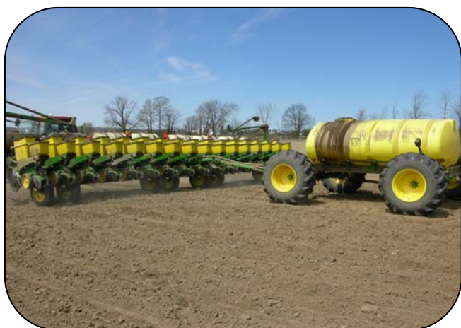
Figure 1. Dunlogon Farms of Stayner Ontario can bring 1,600 gallons of UAN (32%) in a tow-behind-cart in their attempts to keep application costs low and N losses minimized. N is banded 6 inches off the row on the corn planter.

Banded UAN produced 5 to 6 bushels per acre more corn than broadcast UAN in studies in Illinois as well.