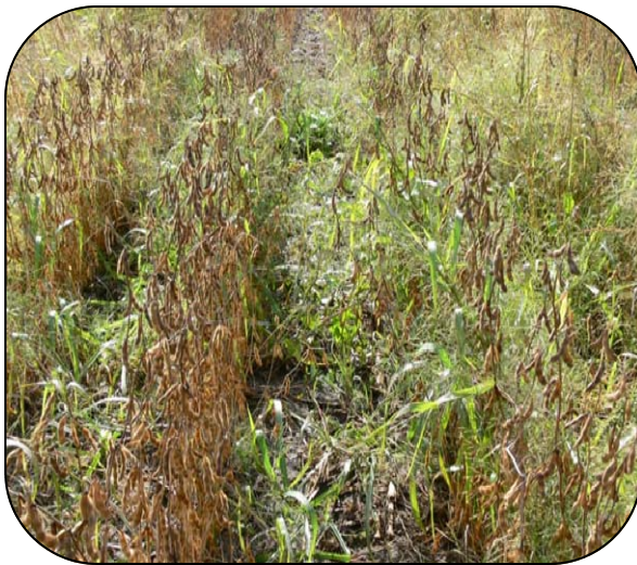
Figure 2. Cleansweep (Woodstock, ON – 2008)