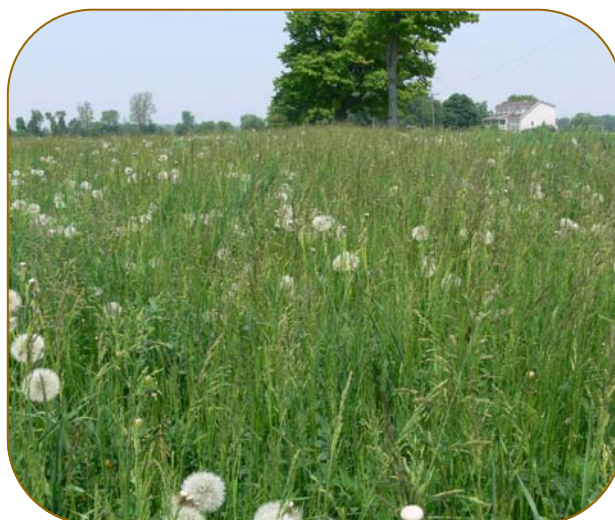
Figure 1. Fowl meadow grass infestation in an alfalfa/ timothy stand

Limitations: This is a preliminary study and more trials are needed to gain confidence that these results can be duplicated under various environmental conditions.