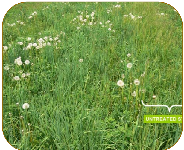
Figure 2. Fowl meadow grass control with Achieve + Turbocharge. Note the presence of timothy in the treated area.