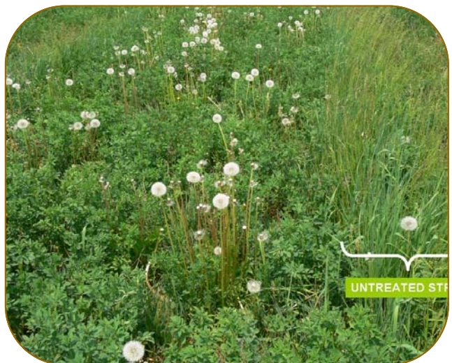
Figure 3. Fowl meadow grass control with Poast Ultra. Note the absence of any timothy in the treated area