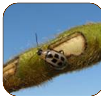
Figure 1: Bean leaf beetle - overwintering generation significantly reduced with Crusier Max

In this set of experiments, the fungicide Maxim-Apron increased yields by up to 32% when high levels of root rot were present and when fields suffered from crusting. This occurred in 3 out of 35 fields. When conditions were excellent for emergence and early growth, no yield benefit was realized. The use of an insecticide was only beneficial when early season bean leaf beetle, aphids or seed corn maggots were a problem.