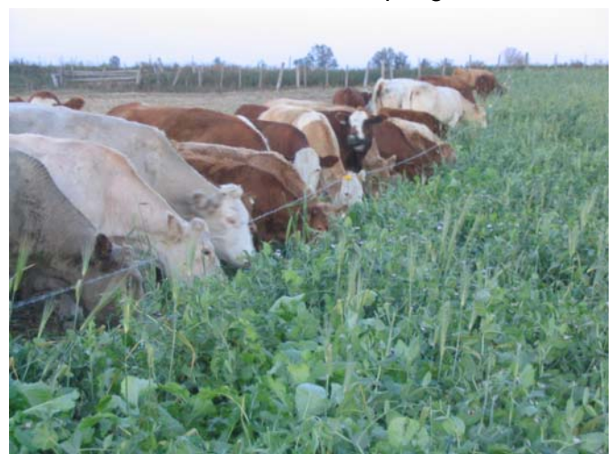
Photo 1 - Cattle strip grazing triticale / forage peas and forage turnips.

Does late fall/winter grazing compact the soil? Research from Nebraska with beef cattle showed that winter grazing crop residues had no significant effect on the following year grain crop yield and additional tillage was not required. However, spring grazing increased the bulk density of the soil, and decreased water infiltration rate. Therefore cattle should not graze crop residues after the soil has thawed in the spring.